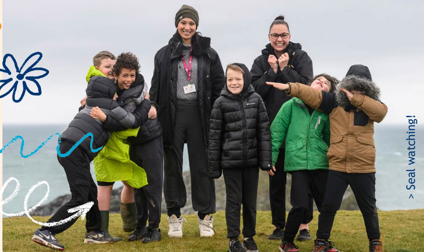
> Seal watching!